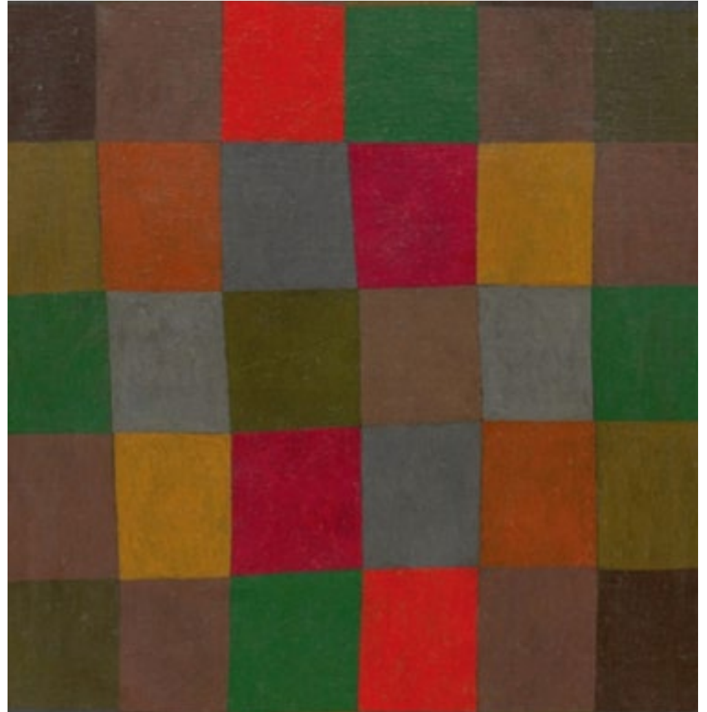
Paul Klee New Harmony, 1936, Oil on canvas, 93.6 x 66.3 cm