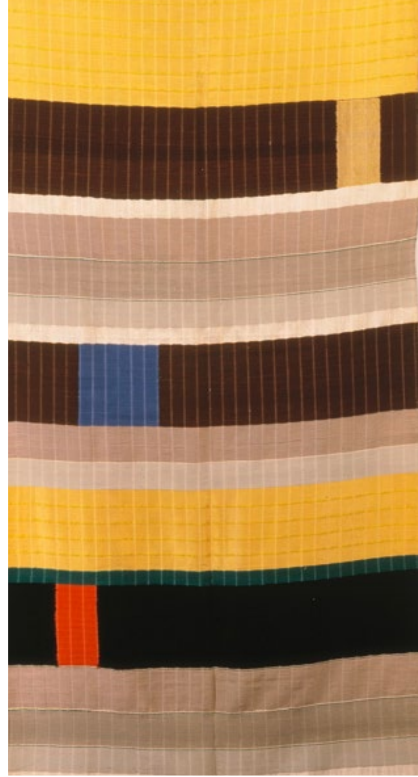
Anni Albers Wallhanging, 1925, 236 x 96 cm