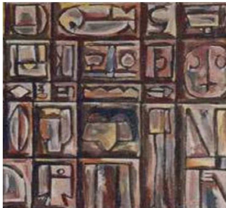
Torres García Composition , 1931, Oil on canvas, 64.7 x 54.6 cm