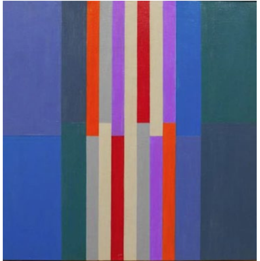
Tomas Maldonado composition 208, 1951, 102 x 101 cm