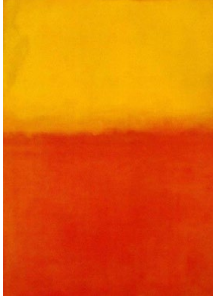
Mark Rothko Orange And Yellow, 1956, Oil on canvas 180.3 x 231 cm